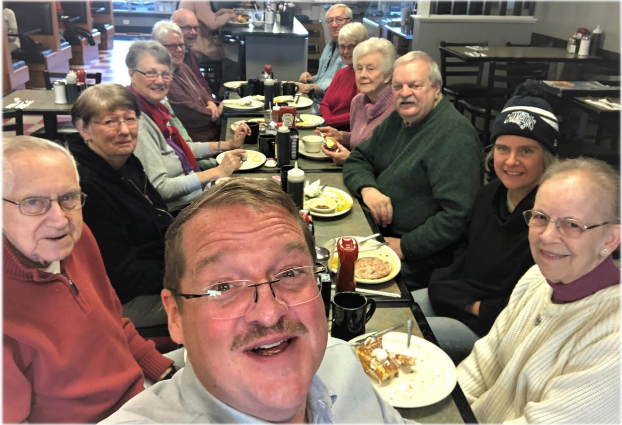
The "Breakfast" group from November.

"Breakfast with Bill" (dutch treat!), is an informal time for friendship and conversation on any topic. We will next gather on Wednesday, December 11 th at 8:00 AM , at Sammy J's, 144 Main Street in Salem, NH.