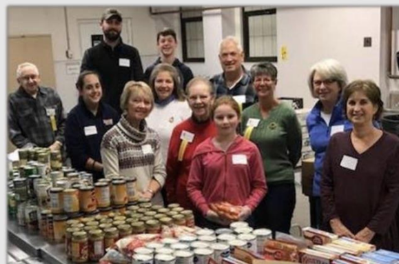
Improving Our Community