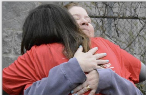
Caring for Each Other